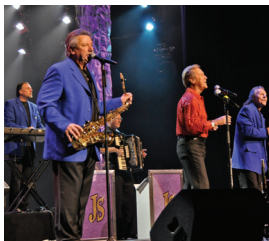
JIMMY STURR & His Orchestra